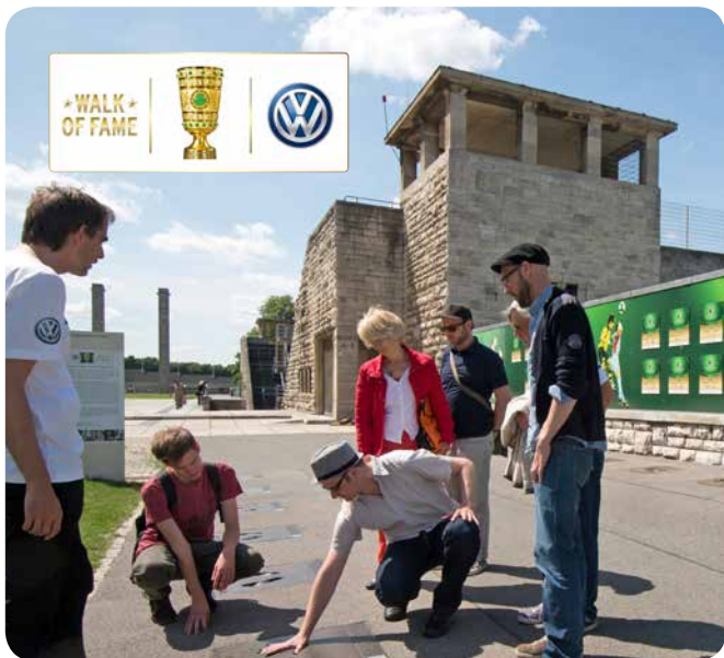
DFB-Pokal Walk of Fame & Wall of Fame

MORE ABOUT ONLINE TICKETS, INFOS AND CURRENT NOTES WWW.OLYMPIASTADION.BERLIN INFOHOTLINE +49 (0)30 / 25 00 23 22