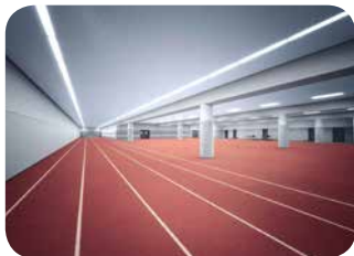
Underground warm-up training hall